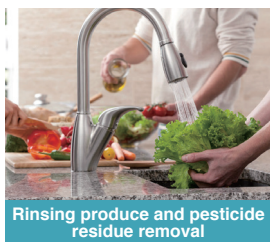
Rinsing produce and pesticide residue removal