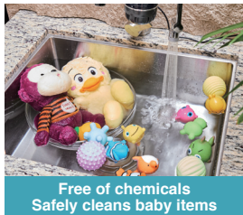
Free of chemicals Safely cleans baby items