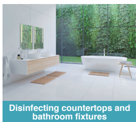
Disinfecting countertops and bathroom fixtures