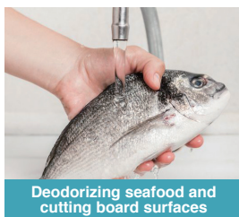
Deodorizing seafood and cutting board surfaces