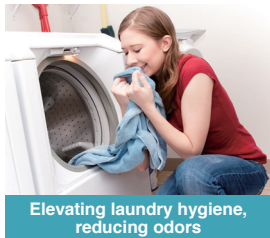
Elevating laundry hygiene, reducing odors