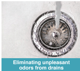
Eliminating unpleasant odors from drains